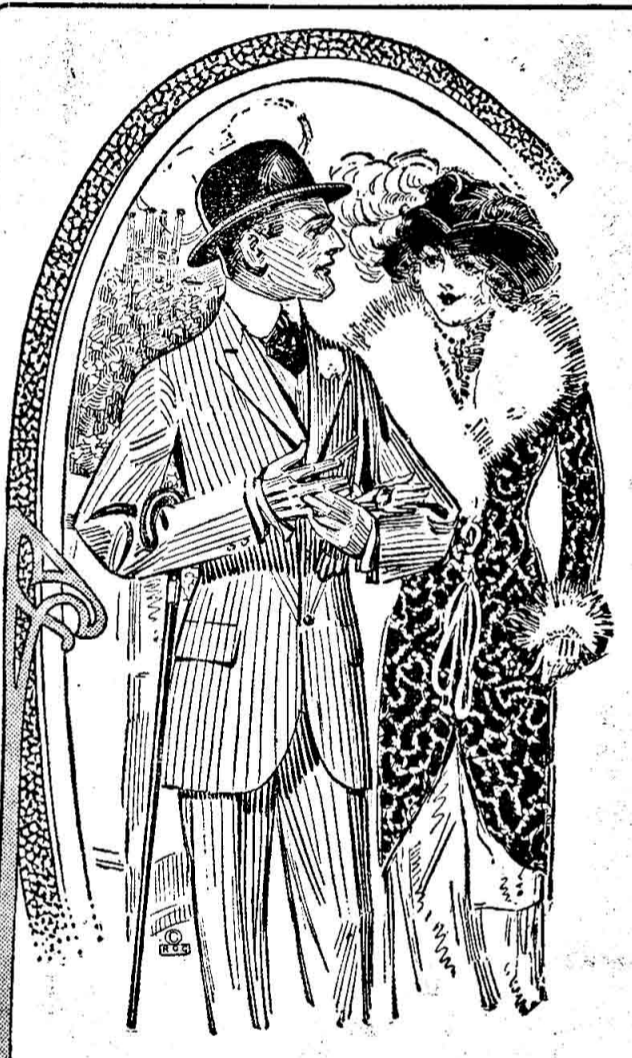
SCHLOSS BALTIMORE CLOTHES

Marion Hardware Co. "The House for Quality" MARION, VIRGINIA